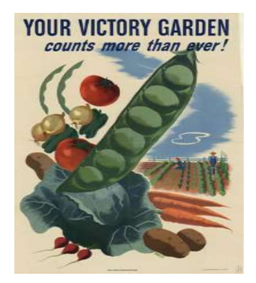
Fig. (1). By Artist: Morley Size: 27"x 19" Publication: [Washington, D.C.] Agriculture Department. War Food Administration. Printer: U.S. Government Printing Office - http://www.art.unt.edu/ntieva/pages/about/newsletters/vol_15/no_1/WarPosterImages.htm, Public Domain, https://commons.wikimedia.org/w/index.php?curid=2030283

An additional distinction of the current conflict is that it lacks a defined enemy and has no delineated end point, making it in some ways more comparable to 'the war on drugs' than a previous armed engagement (Raz, 2006).