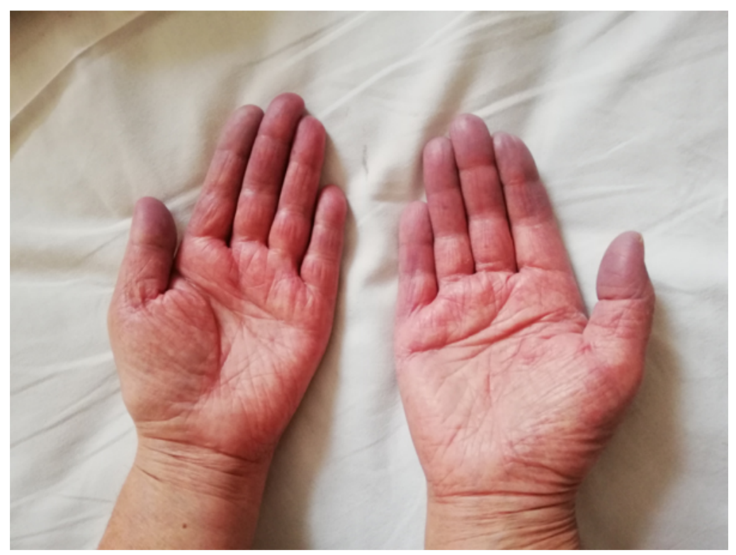
Fig. (1). Vasospastic attack in secondary SSc-related RP, phase of asphyxia with blue discoloration of the fingers; involvement of the thumbs is evident.

Different pathogenesis of primary and secondary RP results in different clinical course, severity, prognosis and respectively requires different therapeutic regimens. Here, the therapeutic strategies in primary and secondary RP in SSc are discussed. The vasospasm in primary RP is reversible while the secondary SSc-related RP is associated with endothelial injury and subsequent structural abnormalities that lead to tissue damage.