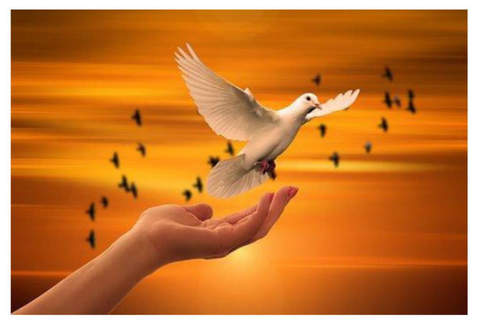
Fig. (11.1). The Dove & Symbol for Spirituality.