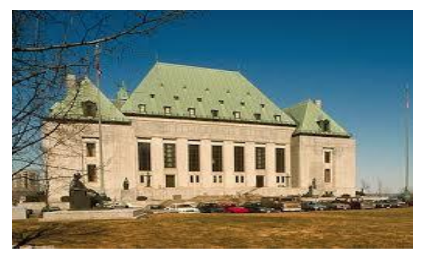
Fig. (3.1). The Supreme Court of Canada.

The Supreme Court of Canada is the highest court in Canada as well as the final court of appeals within the Canadian justice system (Government of Canada: Department of Justice. (n.d.) (Fig. 3.1). The Canadian Supreme Court's rulings are enforceable across Canada, however the Supreme Court of Canada prefers to instruct governments to form statutory laws, particularly on controversial issues.