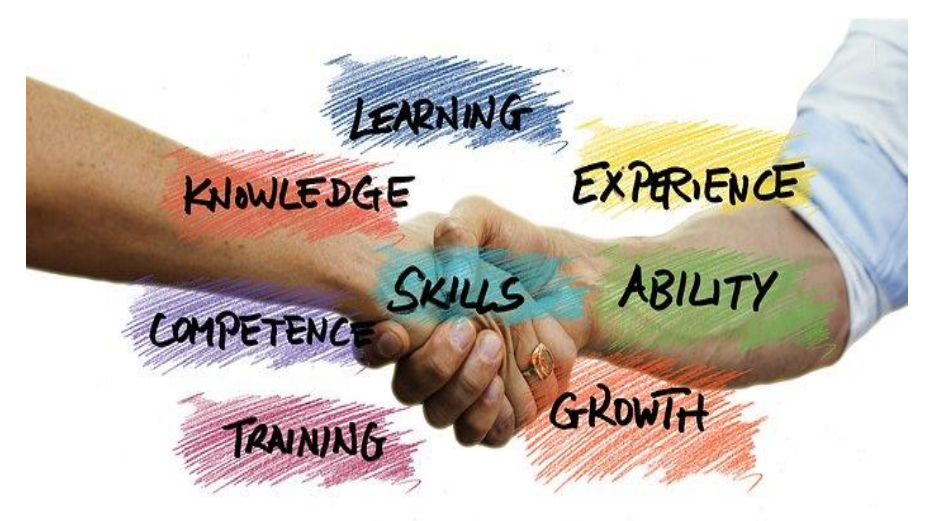
Fig. (6.1). Nursing & Professional Values.

• Apply what was learned to the following two Cases in Point: When a client record is altered & When a nurse is ordered to withhold crucial information.