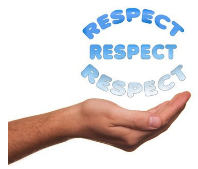
Fig. (4.1). Respect.

In Chapter four nurses gain an appreciation of the fact that personal values are deeply rooted and are not easily changed. They are encouraged to go through the process of uncovering their hidden values through a values clarification process that enhances self-awareness by reflective journaling. Empathetic listening is recommended to respect client values that conflict with their own. Nurses are also made aware that they may encounter morally challenging situations in their practice and that they may become emotionally impacted by this process. Self-care is encouraged as a strategy to combat the negative effects of this problem. The Chapter ends with an exercise that assists nurses in being reminded of their inherent value followed by a Case in Point where a nurse develops moral residue when their values differ from their client's.