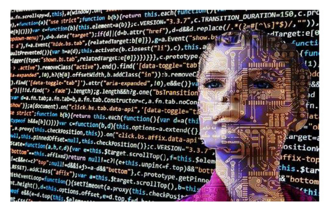
Fig. (8.2). Artificial Intelligence & Robotics.

challenge to the profession of nursing is not to lose the capacity to care. A way to focus on the needs of our clients in a caring way is through the art of mindful listening. The Case in Point shares a heart wrenching story as told by a family member, who felt devastated that they were not informed that their loved one was dying. Nurses are challenged to explore ways in which this situation could have been handled in a more compassionate manner.