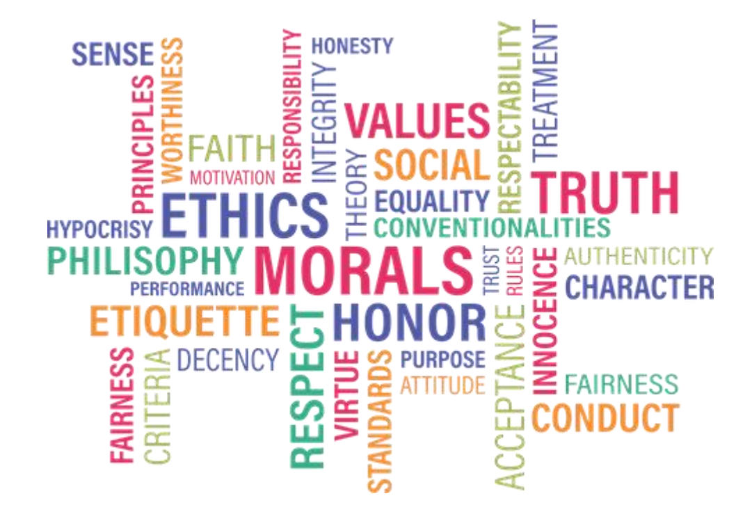
Fig. (2.1). Moral Principles.

Integrity consists of integrating honest ways consistently into one's everyday actions. Integrity has been identified as the moral principle that guarantees all other values, because in the absence of honesty your actions cannot be trusted. Integrity is also referred to as walking the talk or being true to your word and is exemplified by your actions. For example, you are a good nurse to the degree to which you live your life to the highest values that you espouse. Integrity becomes the external manifestation of high standards of expectations that one will be totally honest, will strive for excellence, and live authentically under the guidance of personal responsibility for the decisions one makes (Miller-Tiedeman, 1999). To live authentically is to be true to who you are in the stewardship of self (Hasser-Herrick, 2005).