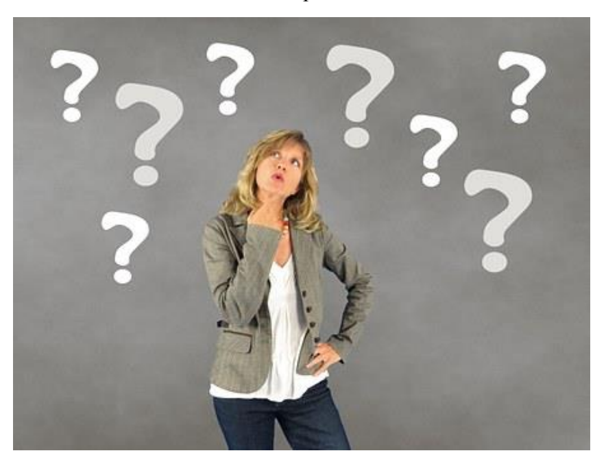
Fig. (5.1). Decision-making.

Chapter Five opens with an overview of the association and differences between ethical problems, ethical dilemmas, moral distress, moral agency and moral residue. An argument is made in favour of the use of ethical models and frameworks as tools to assist nurses in moral decision-making in practice (Fig. 5.1 ). Although there are many ethical models and frameworks, two are explored in this Chapter in considerable detail: The Mosaic Model for Ethical Decisions (Stephany, 2012) and A Framework for Ethical Decision Making (Oberle & Bouchal, 2009). When they are first introduced there is an open discussion of the strengths of each strategy. The aforementioned model and framework are presented in a series of five steps. At the closing of the Chapter the Case in Point illustrates how conflict can occur when opinions differ.