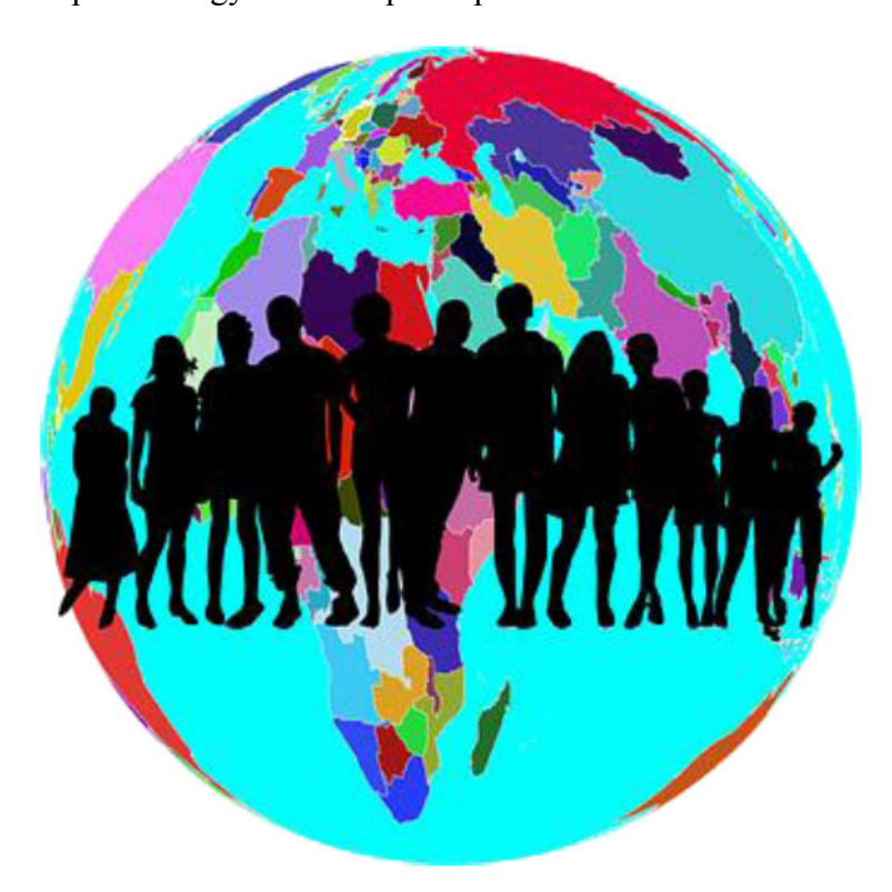
Fig. (10.1). Gender Diversity.