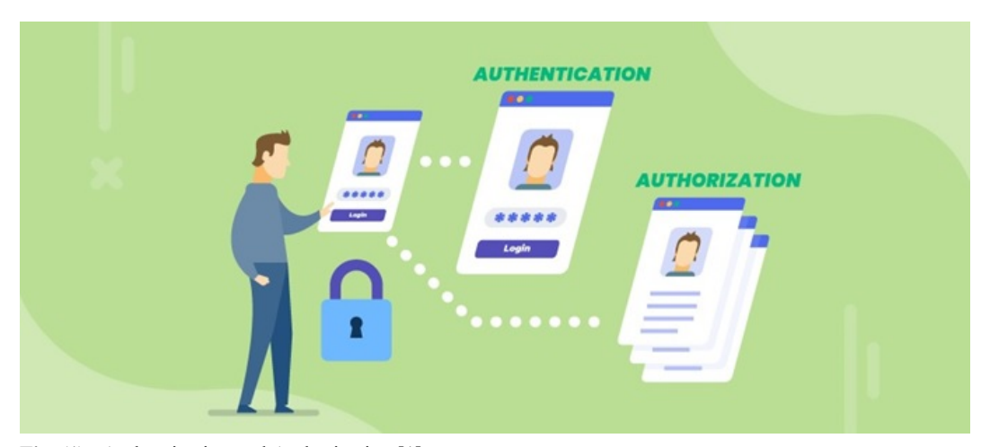
Fig. (1). Authentication and Authorization [1].

Authorization is a process to identify how many access rights a user has once he or she login into the system. This process ensures that a user cannot edit or delete if he has only read-only access. Once a system proceeds with authentication, the next step is an authorization as in Fig. (1) given on [1].