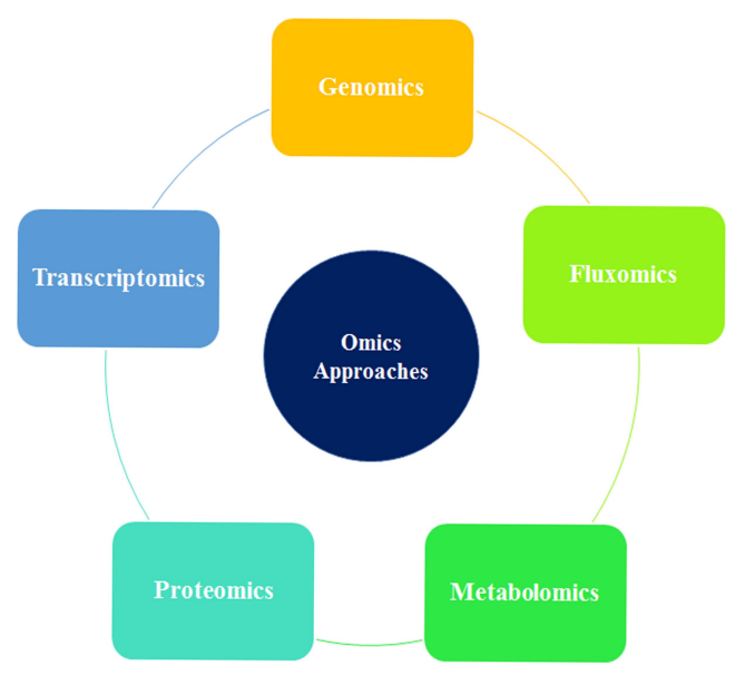
Fig. (1). OMICs approaches applied for bioremediation studies.

A collection of all genomes representing the microbial community is now commonly called the metagenome of that environment. Metaproteomics has emerged as another approach of omics that enable the understanding of the enzymes and proteins encoded by the microbial community, which in turn performs various functions and also helps in predicting the interactions that exist in a community. Additionally, metabolomics and fluxomics also serve as efficient means of studying the metabolites and their rate of conversions by the microbial community. With the help of all these omics approaches, it is now possible to decipher the bacterial genera prevalent in a polluted environment. Further novel microorganisms can also be isolated for the bio-augmentation of the contaminated sites to accelerate the process of bioremediation. Monitoring the community composition, genes, pathways, and the abundance of metabolites throughout the bioremediation process at the contaminated site can be accomplished through omics approaches (Fig. 1). This chapter not only gives an overview but also describes the application of various omics approaches like genomics, transcriptomics, proteomics, metabolomics in studying contaminated sites and accelerating the bioremediation of pollutants (Fig. 2).