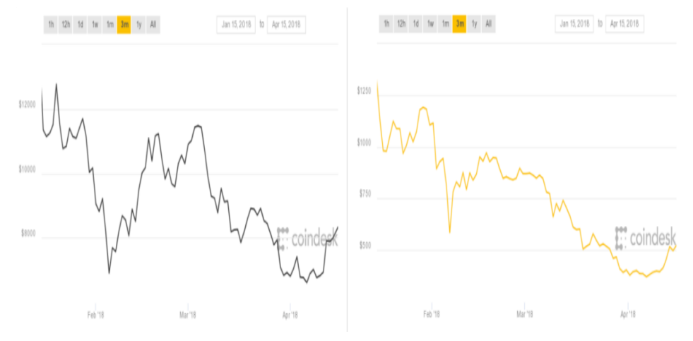
Fig. (2). BTC and ETH Prices, Jan 15 - Apr 15, 2018.

While one could consider this pure coincidence, with a week arguably not being long enough to decipher any relationships between the two, the same can also be seen for a longer period of three months. Consider Fig. (2) below.