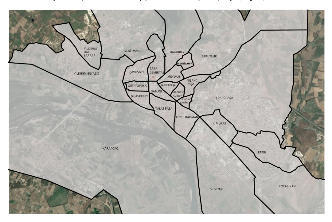
Fig. (1). Map of Edirne neighborhoods.

There were two types of core plans utilized in Edirne at its founding. The first was the grid plan adopted from the West. The grid plan, also known as the Hippopotamus or Hadrian Plan, dating from the Hadrian period, was used to shape the urban form and architecture in Roman colonial settlements. This plan type was also implemented in the sixth century in Kaleici (inner citadel) and Karaağaç districts of Edirne. The second urban plan approach was borrowed from the East and constituted a plan where distinct neighborhoods compose the core of the urban space. This form was observed in the city's districts of Yeniimaret, Yıldırım, Kıyık, Taslık, Sabuni, Ayşekadın, and Cavuşbey (Fig. 1).