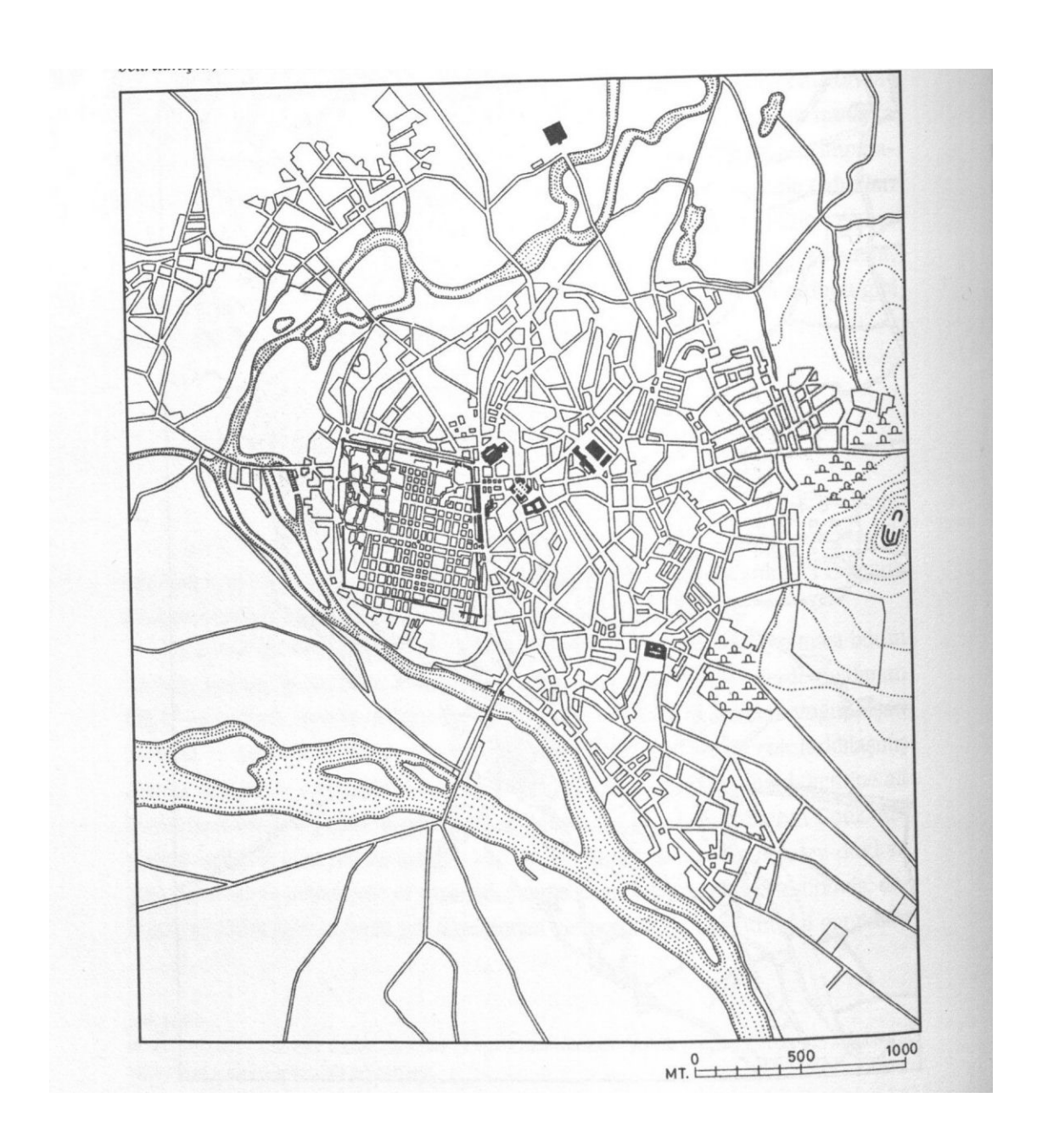
Fig. (2). 19th century Ottoman settlements in Edirne (Cerasi, 1999).