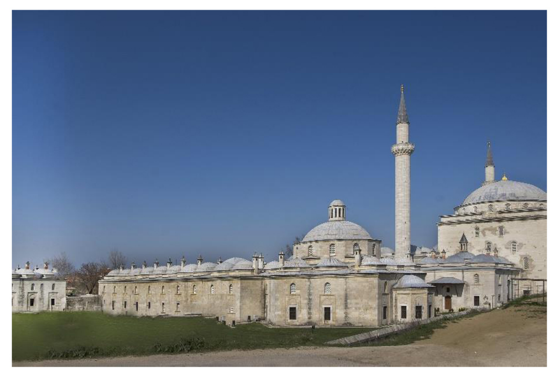
Fig. (1). Beyazıt II Külliyesi (complex).