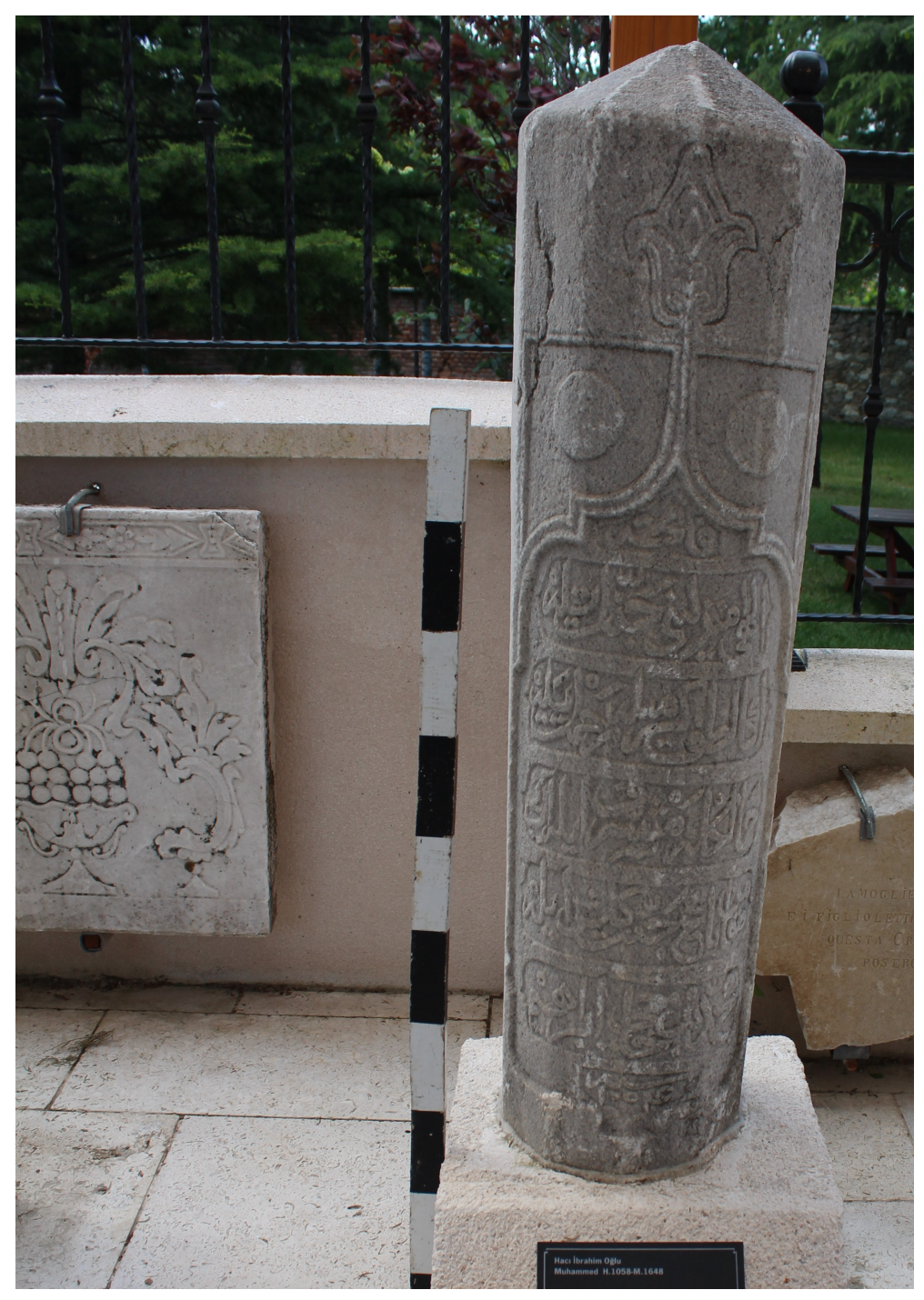
Fig. (2). Edirnekâri gravestone. (Sourace: Edirne Museum).