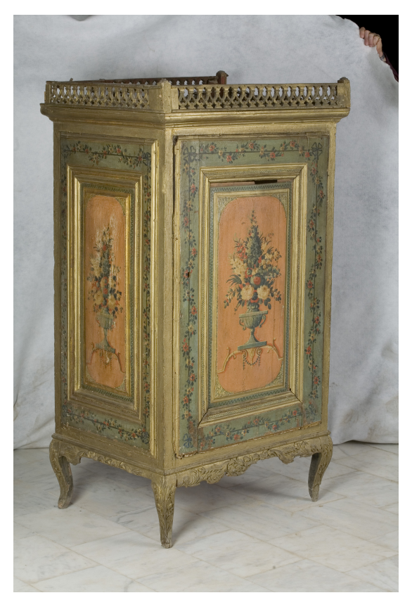
Fig. (1). Edirnekâri cupboard. (Sourace: Edirne Museum).

Traditional Edirne motifs are usually of floral elements, including the tulip, hyacinth, carnation, flower bouquets, or fruits (Figs. 5, 6 and 7). When paint is used to ornament the favorite colors of Edirne, it seems to be natural dyes in shades of iris green, purple, saffron yellow, and chicory and dark browns (Rauf, 1964).